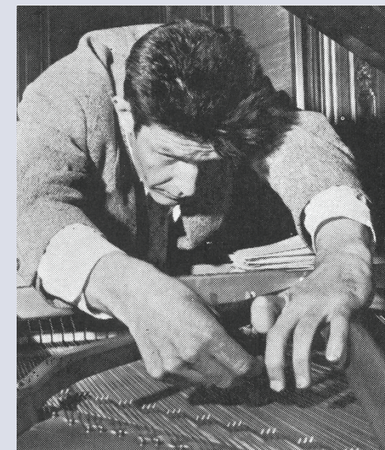
John Cage, left, preparing the piano for a performance of one of his pieces.

In the nineteenth century, most composers wrote concerti for piano or violin. In the twentieth century, composers began to write for other instruments as well. Japanese composer Toru Takemitsu