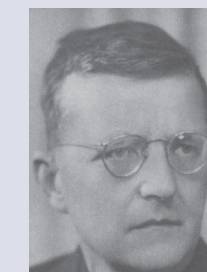
Dmitri Shostakovich, composed in wide variety of genres, including film music.