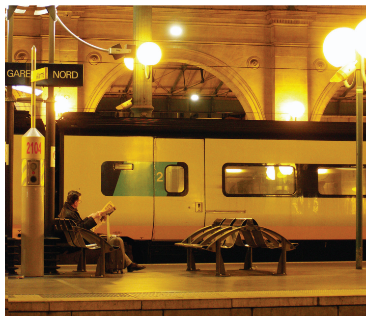
Magnetic tape fueled the emancipation of noise in music. In 1948, Pierre Schaffer created one of the first such pieces using train sounds.

the musicians for the ordering of the music you would hear. Now music became interactive. You could jump from one piece to another piece in any order you would like. This ability to jump quickly among different musics revolutionized the way composers thought about style and musical time.