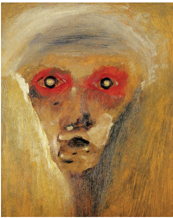
In addition to being a composer, Arnold Schoenberg was also a painter. “Red Gaze” (right) is one of his self-portraits.